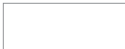
WHITE + WHITE