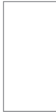
FLAMINGO + PEONY PINK