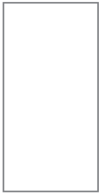
WHITE + VANILLA